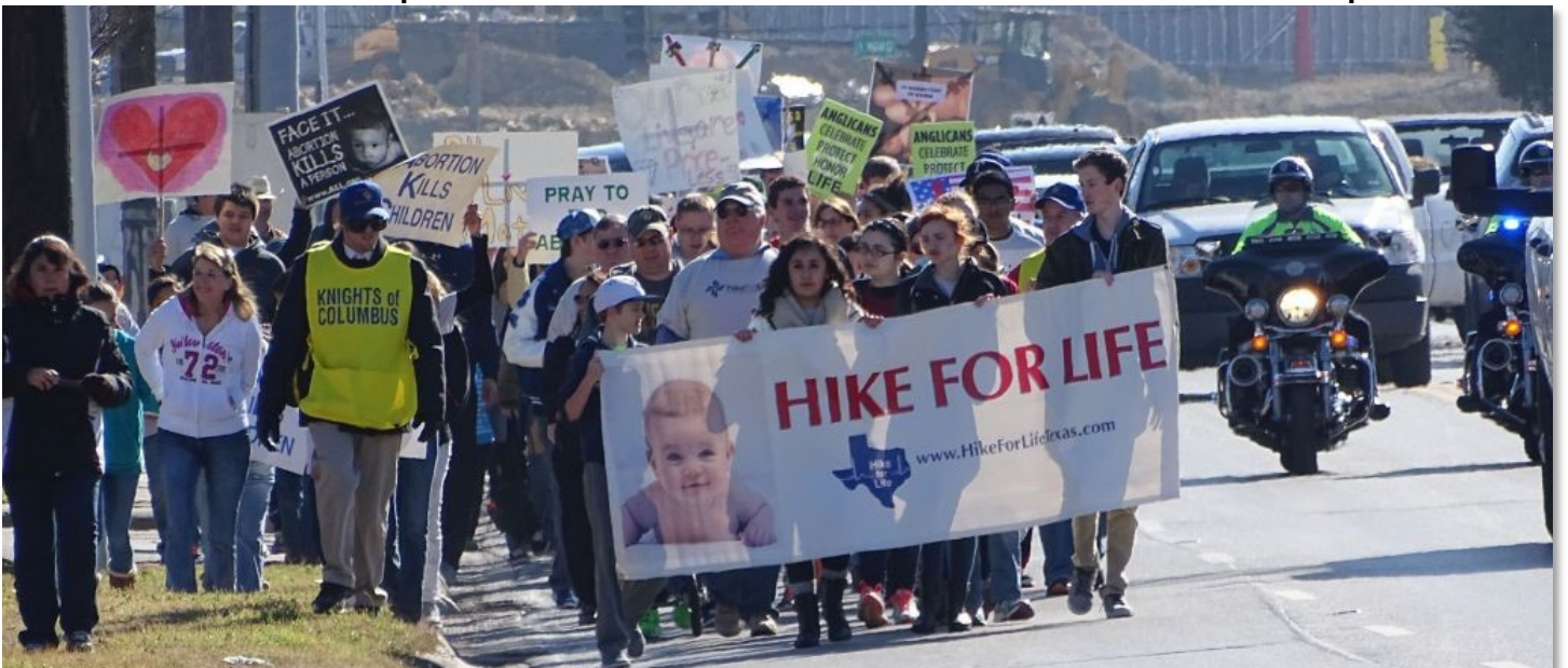
Hike for Life 2016 proceeds down Main Street escorted by Weatherford Police and Brother Knights.