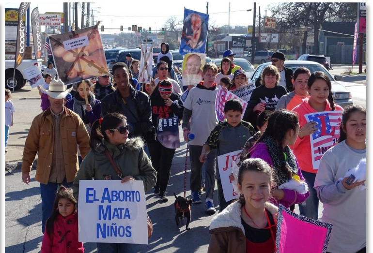
Many pro-life messages were displayed during the 3.5 mile hike from the church to the chapel and back.