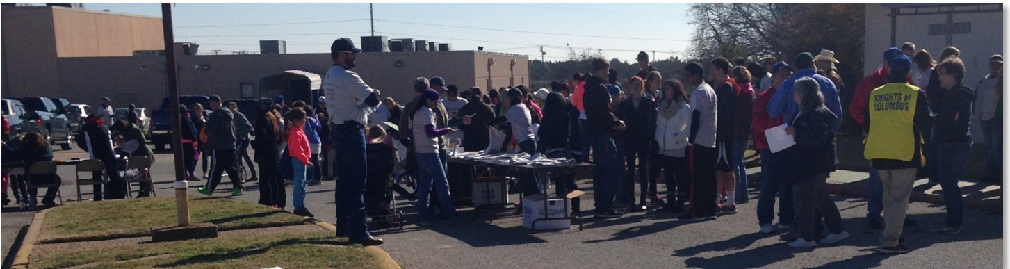
Hikers from all over the area, including several different local churches, arrive early for registration.